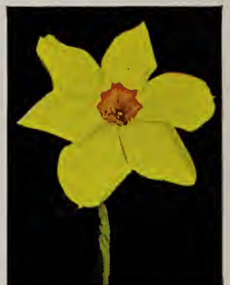
NARCISSUS BARRI CONSPICUOUS